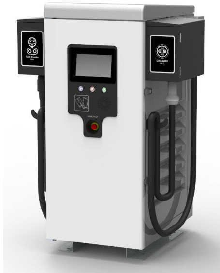
Figure 5 The CHAdeMO certified EV charging unit used at KM Mesaimeer buildings complex

Kahramaa also endorses the CHAdeMO Standard (for DC fast chargers), which is considered to be the leading standard for DC fast chargers. CHAdeMO Standard was introduced in 2010 by the CHAdeMO Association (which includes five major Japanese automakers). Currently, this standard is adopted in 71 countries and by 438 corporate members. The CHAdeMO Standard is included in the IEC61851 23-24 (standard for EV conductive charging) and IEC62196 (standard for EV plugs, sockets, outlets, and vehicle connectors). An updated list for CHAdeMO certified DC fast chargers can be accessed here: https://www.chademo.com/products/chargers/ . The recently inaugurated solar-powered EV charging station at the Kahramaa Mesaimeer Complex utilized the CHAdeMO certified SIGNET EV DC fast charger (see Figure 5).