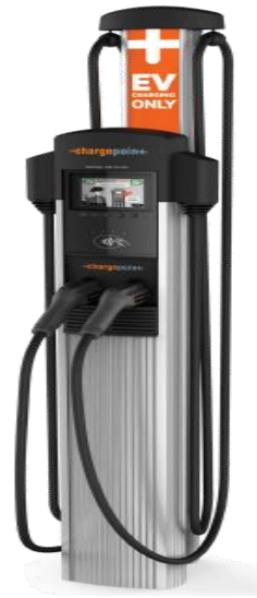
Figure 2 Example of a commercial public charger

Given that most EV car owners will likely require multiple charging options (home and in public), Kahramaa will be adopting technical standards for both charging technologies and will ensure that a sufficient amount of AC and DC chargers are optimally located throughout Qatar. Kahramaa will provide comprehensive information on best charging habits for EV car owners (which includes charging frequency and battery maintenance).