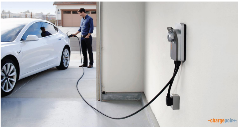
Figure 1 Example of a residential home charger

There are two broad categories for charging stations: residential and public. Residential charging units are those located in residential buildings (villas, public areas in residential compounds etc) and these are usually AC chargers with charging rates of up to 22 kW. There are two types of residential charges: AC level 1 ( \approx 4\text{kW} ) and AC level 2 (7 kW--20kW). The second category is public chargers which can be located in shopping malls parking, premises of commercial areas, workplaces, highways etc and can be either AC, DC, or fast DC. The charging rate of commercial public chargers can reach up to 150 kW depending on the charging technology. Examples of residential and public chargers are given in Figure 1 and Figure 2.